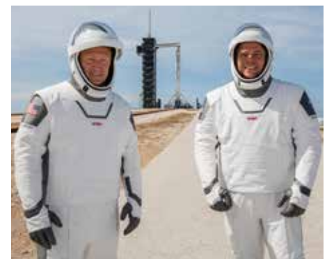
Above: NASA astronauts Douglas Hurley (left) and Robert Behnken (right) participate in a dress rehearsal for launch at the agency's Kennedy Space Centre in Florida on May 23, 2020, ahead of NASA's SpaceX Demo-2 mission to the International Space Station.