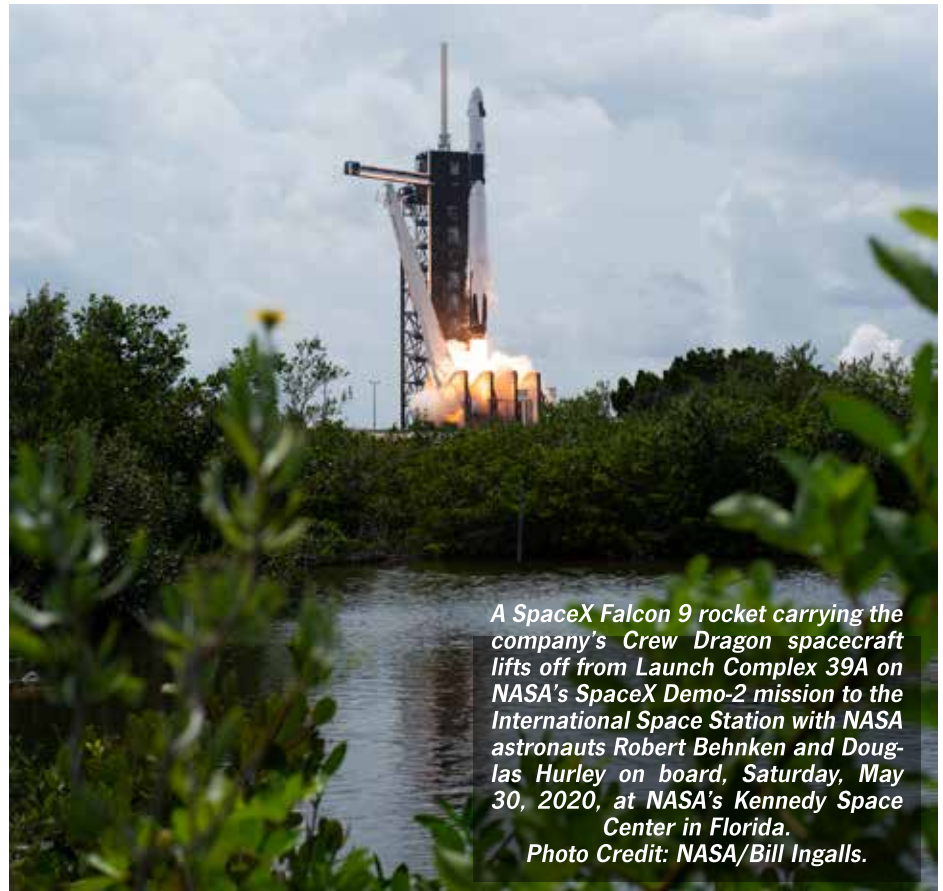
A SpaceX Falcon 9 rocket carrying the company's Crew Dragon spacecraft lifts off from Launch Complex 39A on NASA's SpaceX Demo-2 mission to the International Space Station with NASA astronauts Robert Behnken and Douglas Hurley on board, Saturday, May 30, 2020, at NASA's Kennedy Space Center in Florida.

"This is a dream come true for me and everyone at SpaceX," said Elon Musk, chief engineer at SpaceX. "It is the culmination of an incredible amount of work by the SpaceX team, by NASA and by a number of other partners in the process of making this happen. You can look at this as the results of a hundred thousand people roughly when you